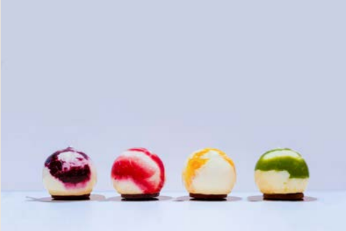
Patisserie G, Millenia Walk