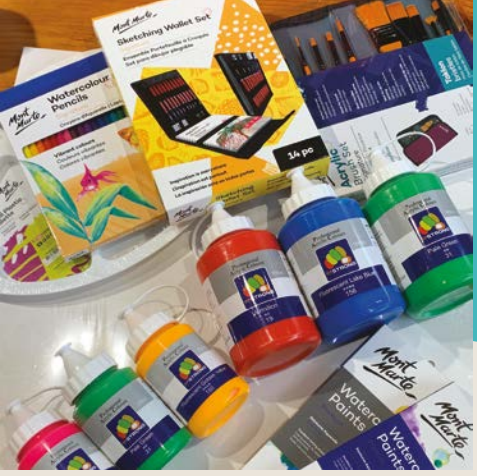
Umistrong Art Hub, Suntec City