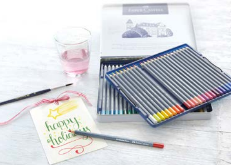
Faber-Castell, Marina Square