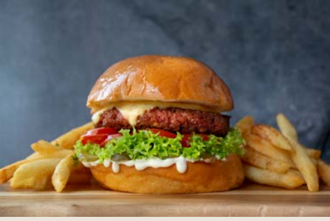
Harry's, South Beach